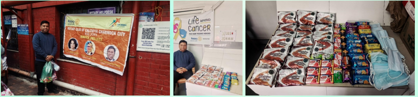
Monthly project at SSKM Hospital on 19th December, 2024