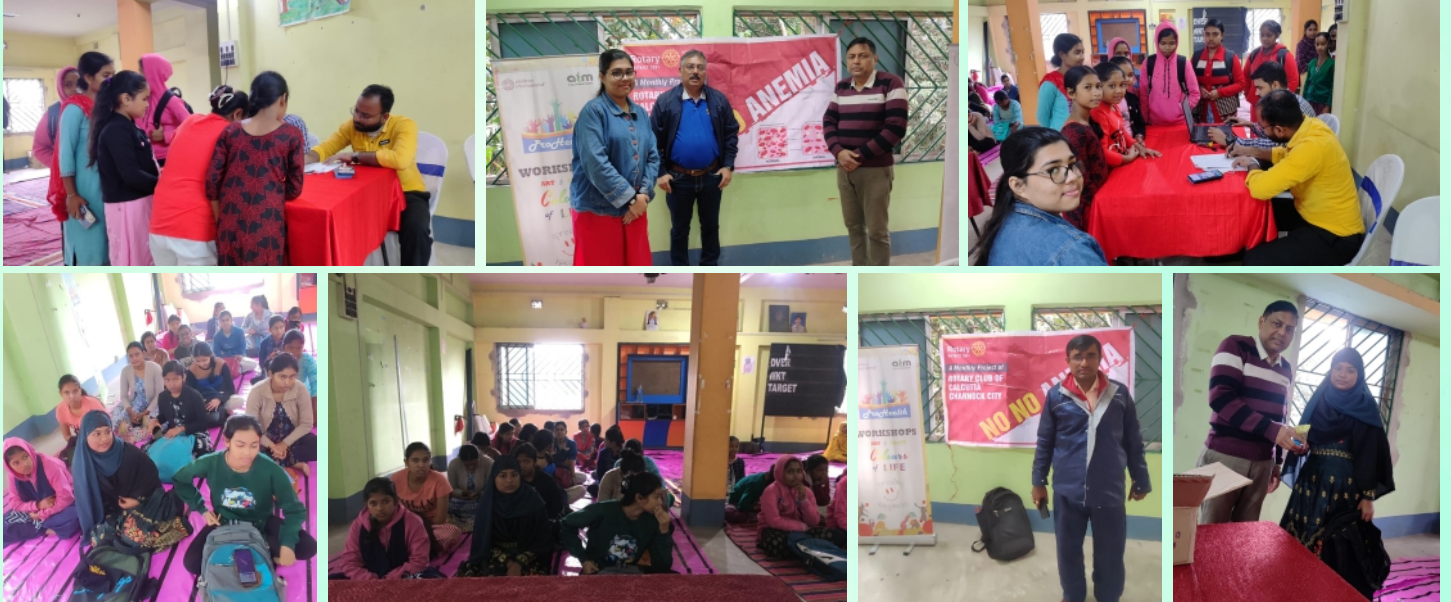
Monthly project NO NO ANEMIA on 21st December, 2024