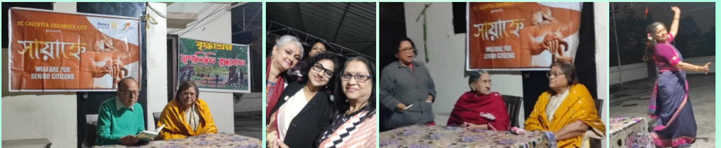
Monthly visit to Mrinalini Bridhasram on 22nd December, 2024